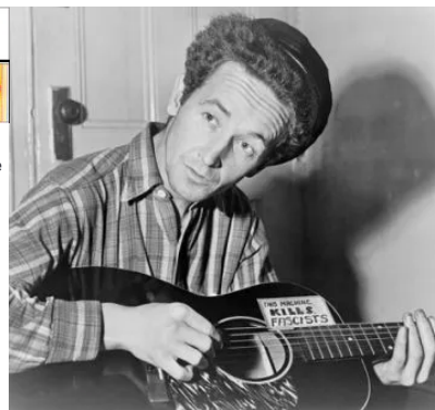
Woody Guthrie was an American folk singer and songwriter, known for songs like "This Land is Your Land," "Pretty Boy Floyd," and "Hard, Ain't It Hard." He died in 1967.